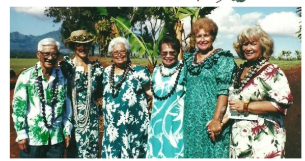
Hawaiian Civic Club of Wahiawā Kūpuna Y2K