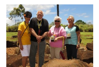
Maui Kūpuna Makua 2k15