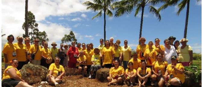
Oʻahu Kūpuna Makua 2k15