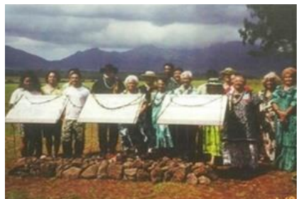
HCCW Y2K Kukaniloko Sign Installation