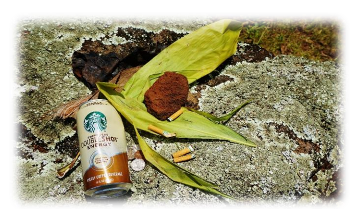
Auwē! Auwē, Auwē!

butts, soft drink cans, and coins are often left behind. Every so often, inappropriately, small pohaku of unknown origins are wrapped in ti - leaf and left hidden in places within the areas of posted "No Public Access" signs.