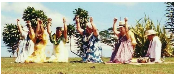
Waianae Kai Kūpuna 2k9